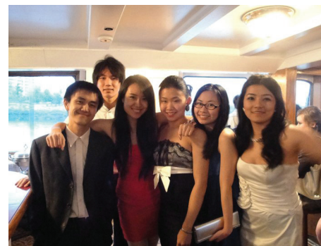
YEAR END CRUISE

The Year End Cruise was our graduation dinner and dance event. More than 180 people attended, including students from other programs, graduate students, and professors, making it an absolutely