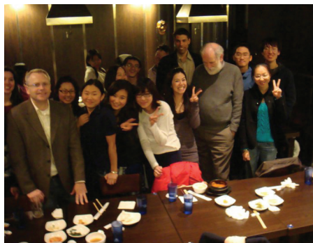
DINNER WITH PROFS

The Economics Tri-Mentoring Program introduces students to the unlimited possibilities of an economics degree in the real world. This year, we had 11 mentors and 22 mentees participating in our year-long program. The program included the Kick-Off event in October, where mentors and mentees met for the first time, and two social events, where students exchanged their thoughts on their future careers. Throughout the year, we had the opportunity to visit our mentors in the workplace and see the real environments of our potential careers. Our mentors gave us tips on finding a job, and they looked over and provided insight on our resumes. The Tri-Mentoring Program is one of the highest impact programs organized by the ESA.