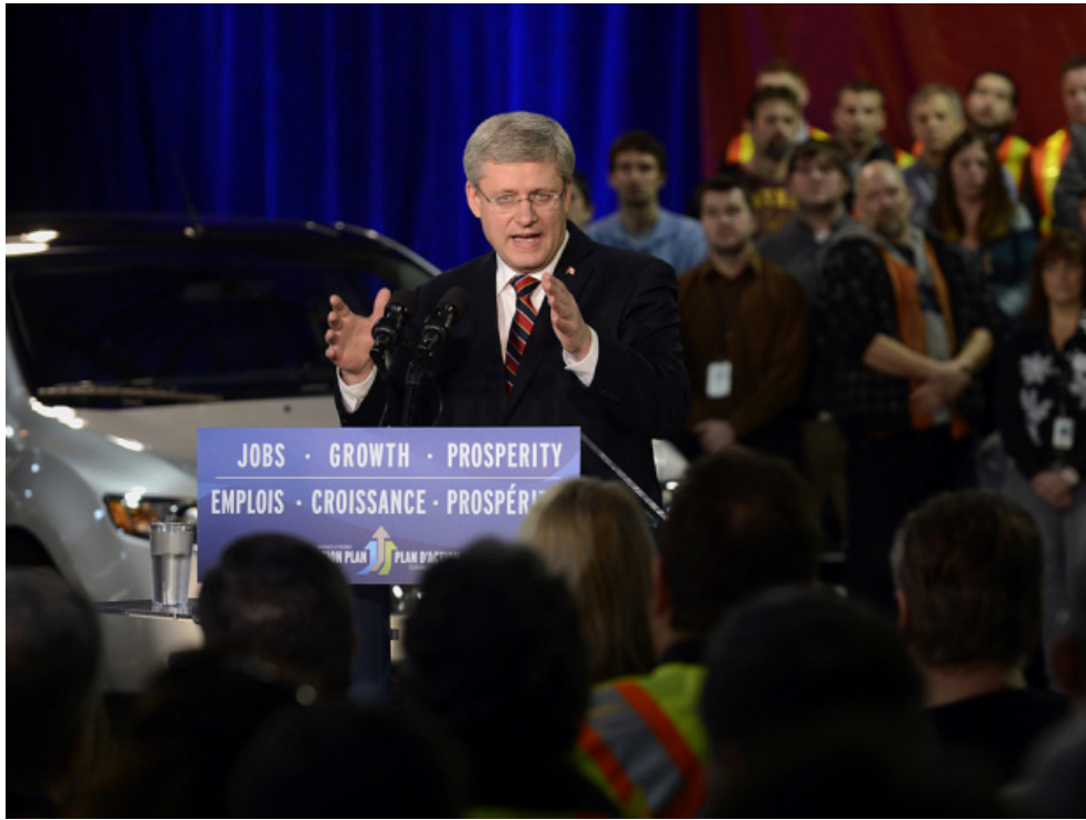
"A strong resource sector in the west means high-quality manufacturing jobs in the east," Harper said Jan. 4 at a Ford Motor Co. of Canada Ltd. factory in Oakville, Ontario.

Harper and his cabinet ministers have argued that developing Alberta's oil sands, part of the world's third largest oil reserves, will bring economic opportunity across the country. Natural Resources Minister Joe Oliver estimates that more than 600 major resource projects may lead to $650-billion of investment over the next decade.